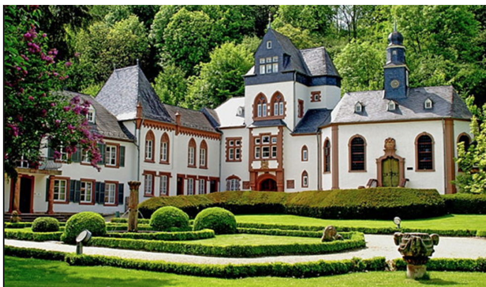
Schloss Dagstuhl in Wadern, Germany

What makes Dagstuhl so special? The primary feature of the venue is that everything is designed to support communication between participants. The remote location encourages participants to focus on the work without interruption, enabling intensive discussion and triggering new ideas. The seminar and break-out rooms are comfortable and conveniently located and bring people together for large and small meetings. Because participants stay for the week, they can work together through the day and continue into the evening if desired, but they can also take advantage of other social activities in the evening, such as ping-pong, billiards, or discussions in the wine cellar. Building relationships in this way results in more efficient communication and higher quality interactions overall, leading to enhanced productivity and good outcomes.